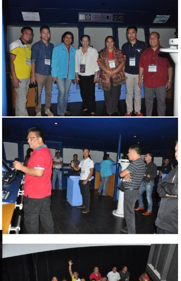
Tour at the Motion Bridge Simulator