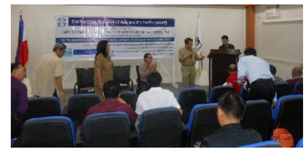
VADM Santos providing the closing message — encouraging the participants to be agent of change in their institutions