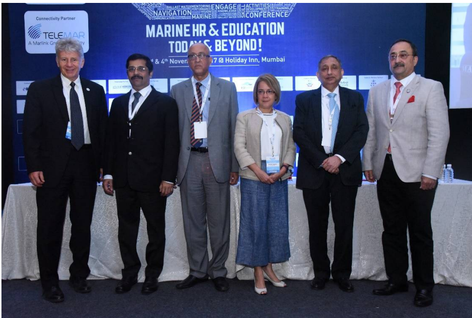
Photo 3: The speakers included eminent personalities from the world of shipping

An unmatched session, where representatives from Ukraine, Philippines, China and India shared the latest updates and status of the recruitment and training of Human Resources in their countries