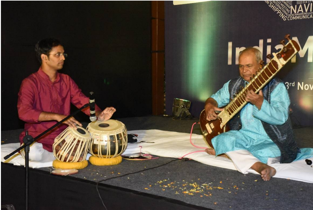
Photo 8: The event included an evening Indian classical music 'tabla and sitar jugalbandi' performance for the benefit of the guests

The attendees were also welcomed to the grand IndiaMET awards, where the pillars of Maritime Training and Education in India were awarded. The audience was entertained with authentic Indian Classical Music and Dance Performances, making it a fun filled evening