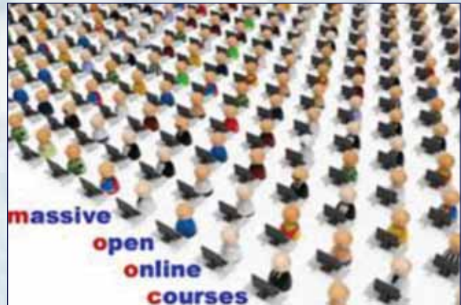
Figure 2 – MOOC: Creative Commons 2014

University, John Hopkins, University of Amsterdam, Museum of Modern Arts, University of Michigan, The Hong Kong University, Vanderbilt University,