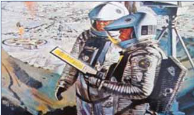
Figure 1 – The Future is Now Online: Creative Commons 2014