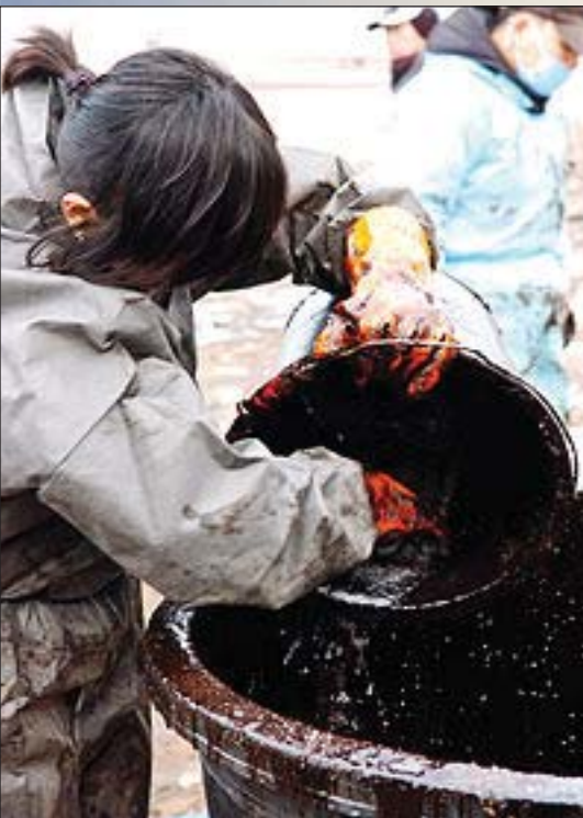
Volunteer workers from South Korea cleaning up oil spill caused by Hebei Spirit in 2007