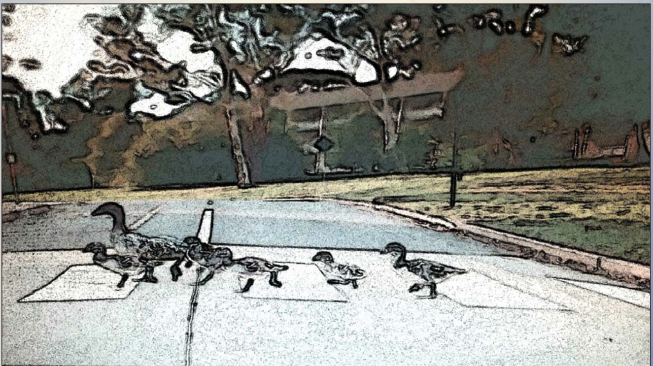
Figure 1 - The Birds of Dinggiri

Permission requested from Australian National University (ANU)